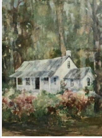
on the cover: This beautiful framed print used to hang on the walls of the former Marshwood club house, and is up for bid at this year's annual Auctionmania.