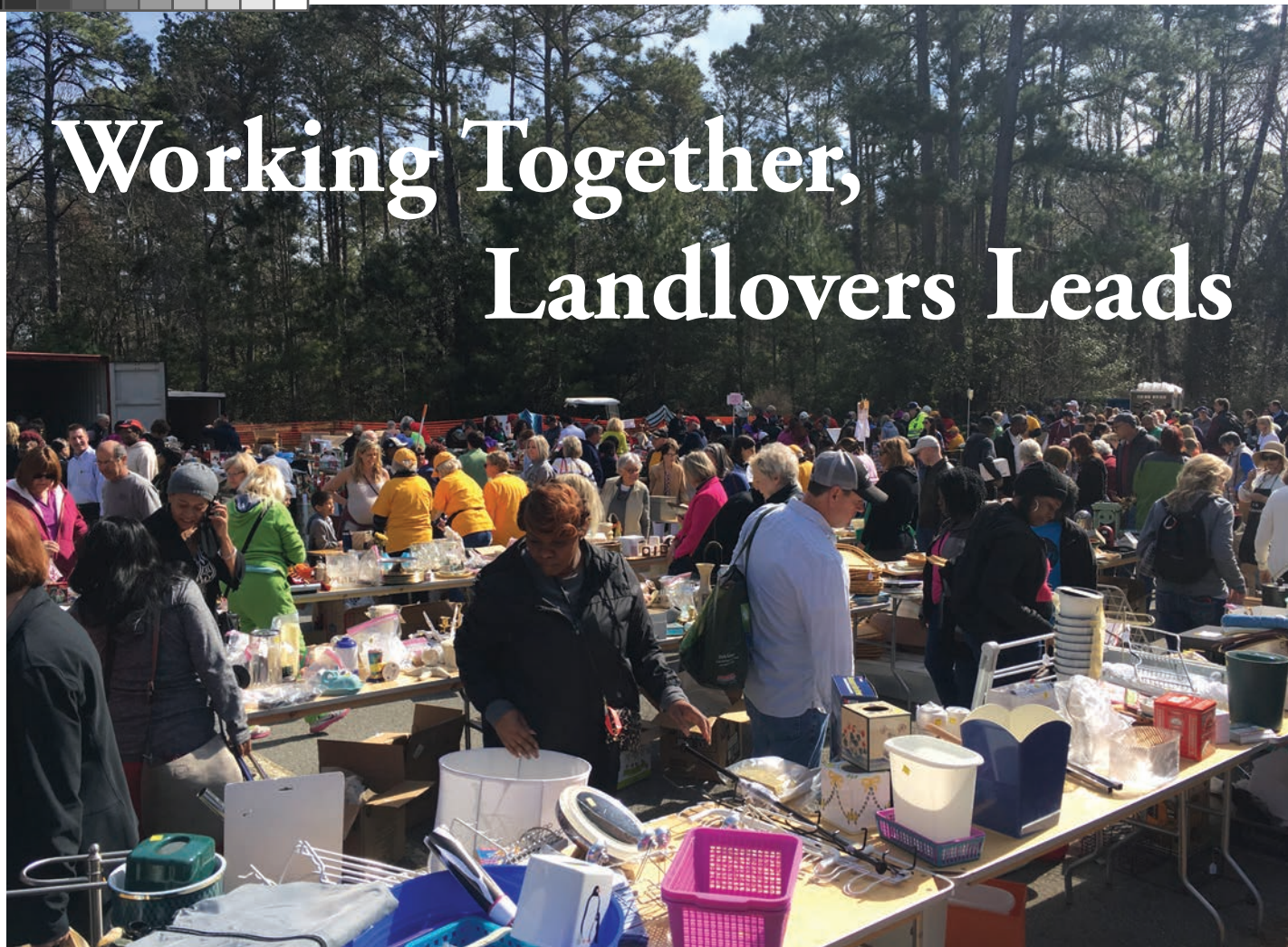
The giant annual flea market is set for Saturday, March 9. The area is laid out in sections with merchandise clearly marked, like a deep discount outdoor department store.

Although most flea markets and auctions are run by business people for commercial purposes, the annual Landings Landlovers Flea Market and Auctionmania depends entirely upon volunteers who organize, clean, price, display and sell donated goods. And the items for sale come to Landlovers because of the generosity of neighbors like you.